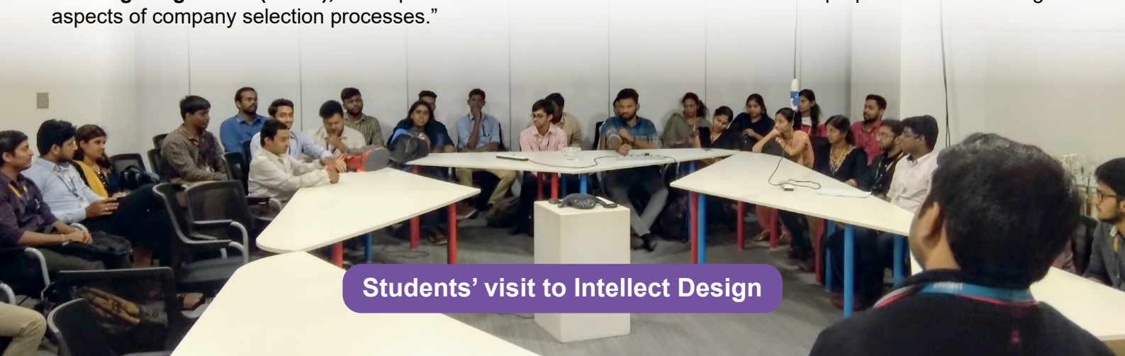
Students' visit to Intellect Design

"Two other distinguishing features of RSB are, first, our Corporate Mentorship Programme , wherein as a medium of additional corporate exposure and learning, our 2 nd year students are attached to a senior executive of the company where they did their summer internship; and second, our comprehensive Career Enhancement Training Programme (CETP) , which provides 360° in-classroom and off-classroom preparation for handling all aspects of company selection processes."