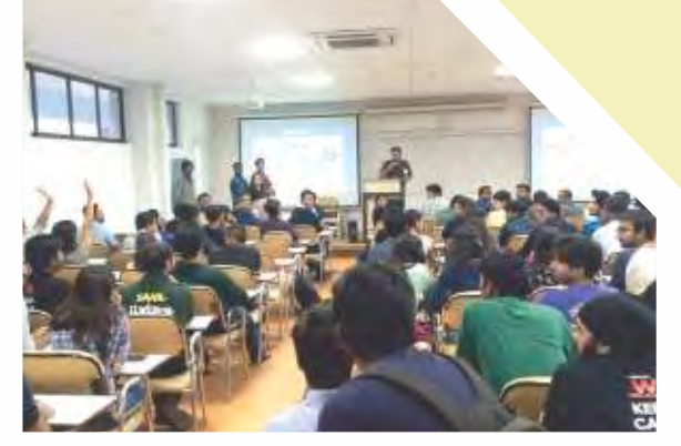
Symbihaat -35 teams battling it out for 12 coveted stalls – Entrepreneurship Summit 2016