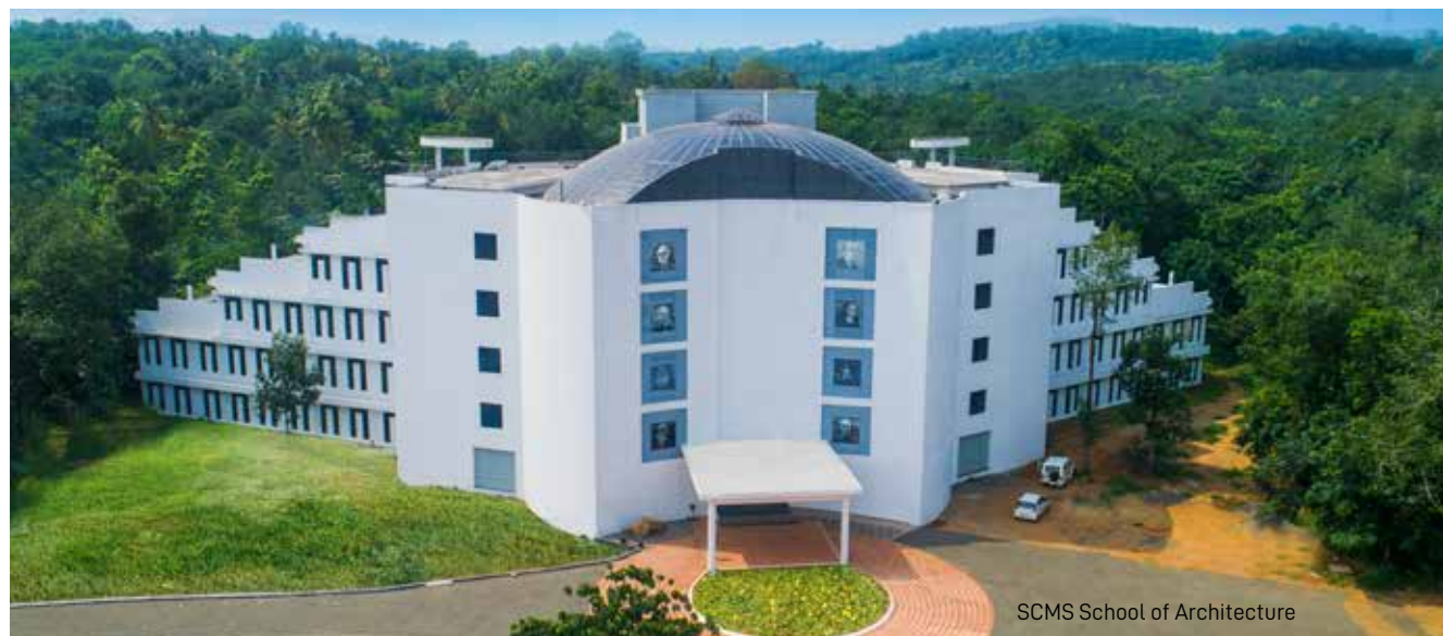
SCMS School of Architecture

qualified faculty to train aspiring students to become socially responsible architects. The 5-year B.Arch course is approved by Council of Architecture, New Delhi, and affiliated to M.G. University, Kerala.