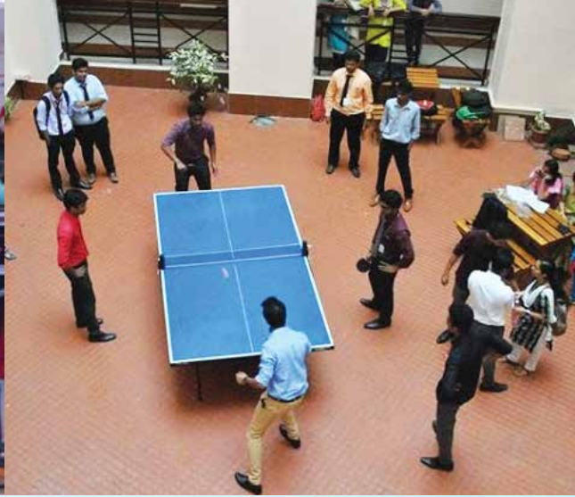
Table Tennis Tournament