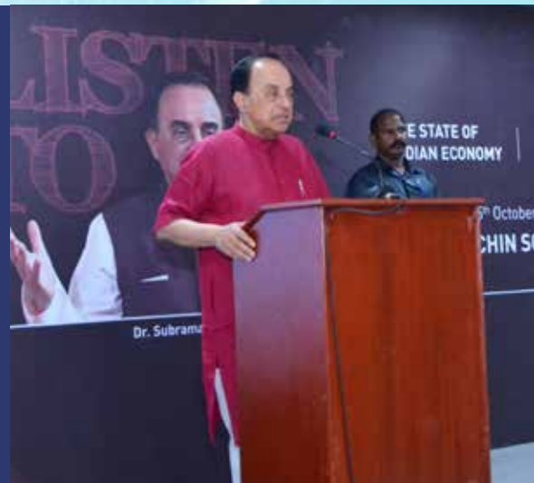
Address by Dr. Subramanian Swamy