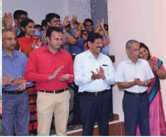
New Year's Day Celebrations, 2018