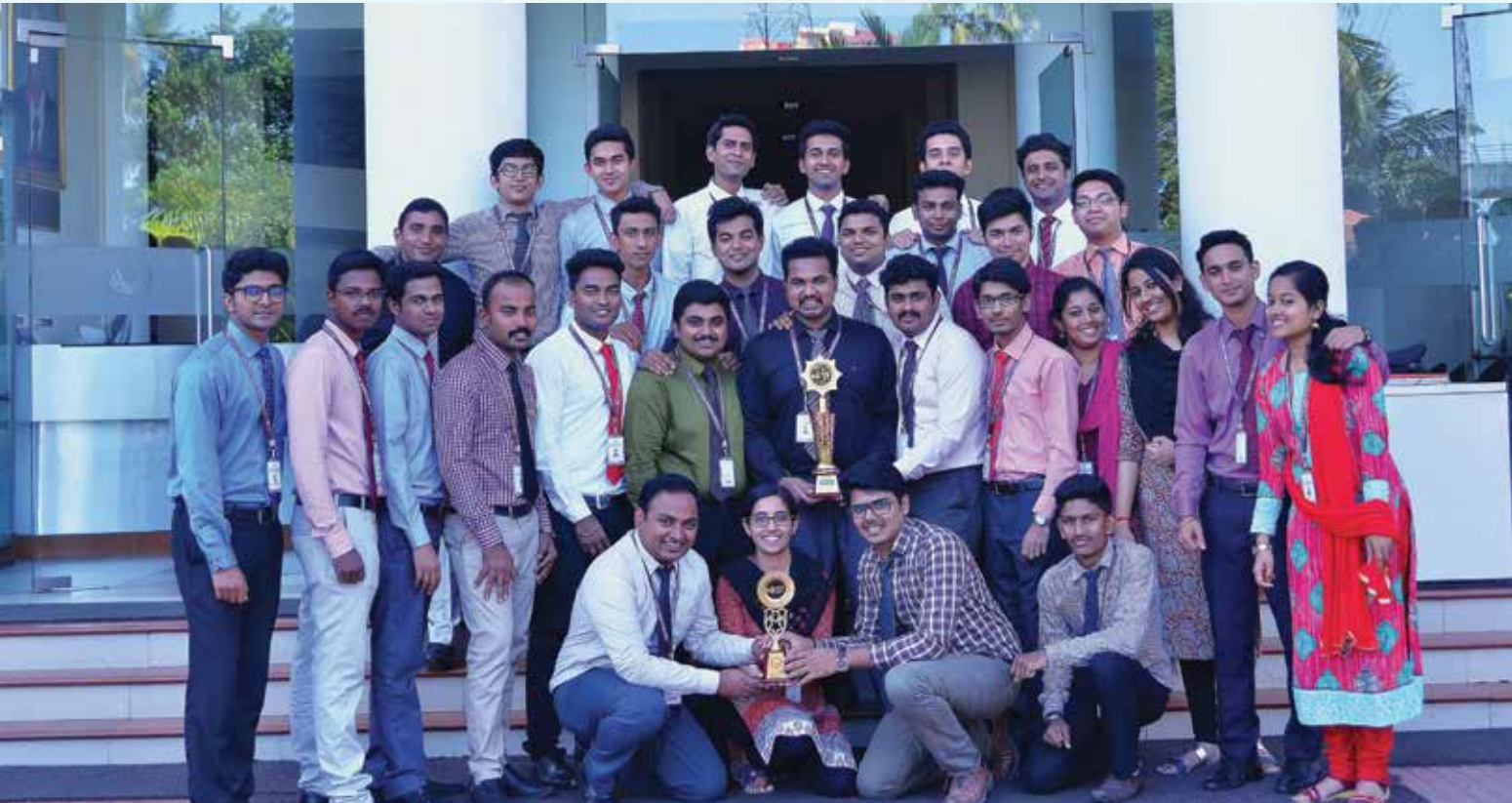
Winners at Rajagiri Fest