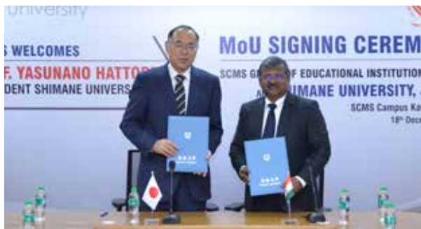
MOU with Shimane University Japan