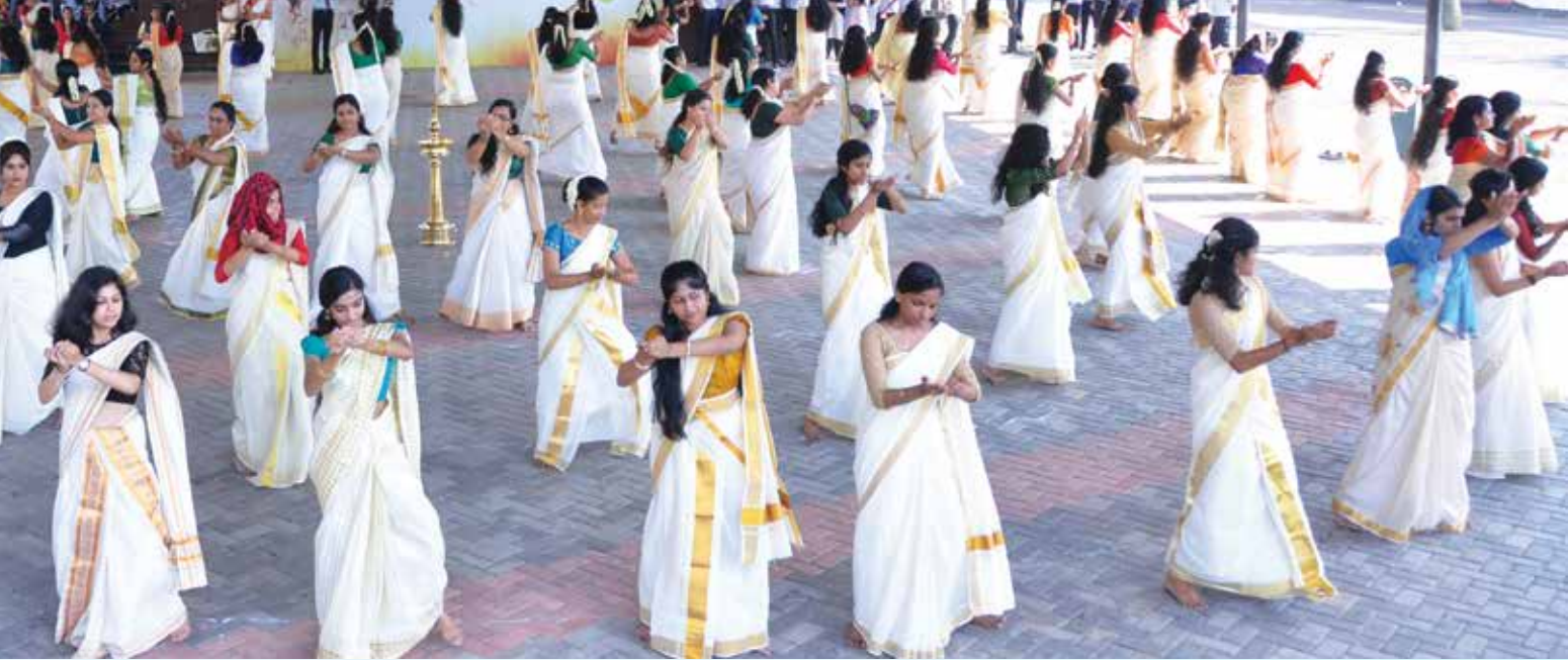
Kerala Piravi celebrations