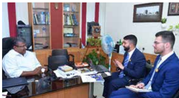
Canada Vancouver Island University Team Visit