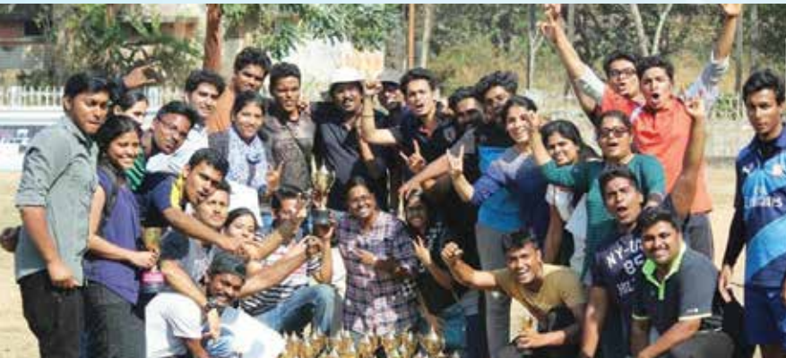
Winners with their trophies