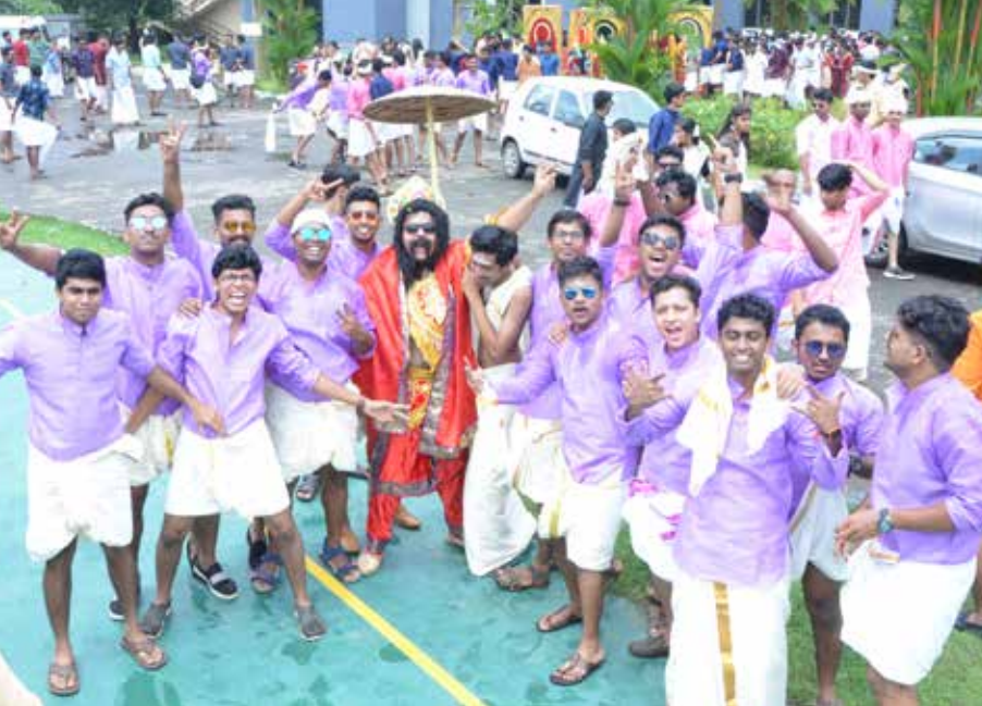
Onam celebrations at SCMS