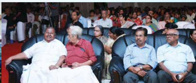
Moments from the Founder's Day Celebrations