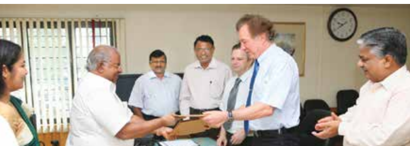
Close partnership with Ravensburg-Weingarten University