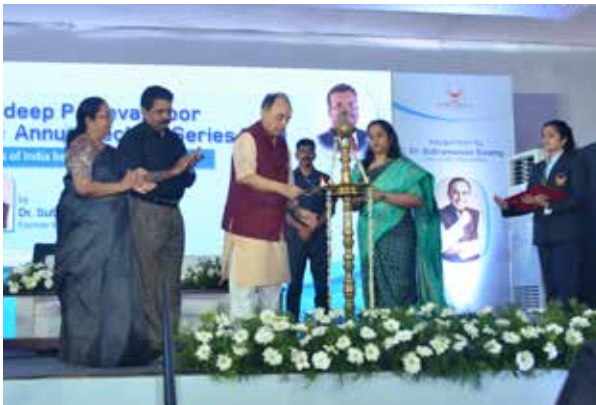
Dr. Subramanian Swamy addressing the 3rd edition