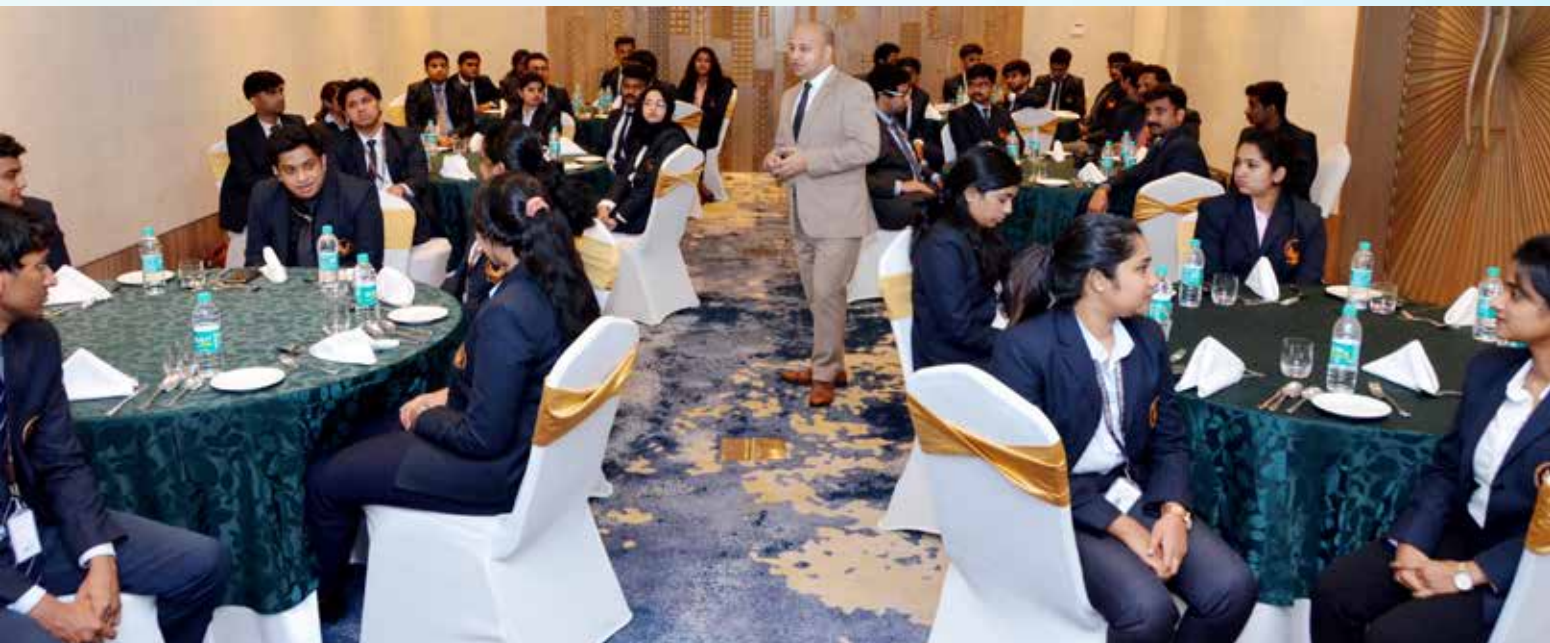
Dining Etiquette Training