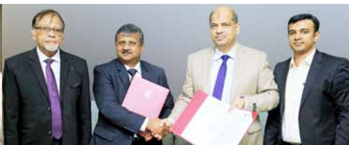
MOU Signing – Daffodil International University, Dhaka, Bangladesh