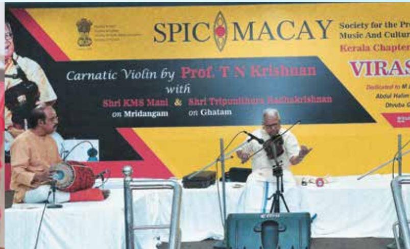
Violin Concert by Shri. T. N. Krishnan