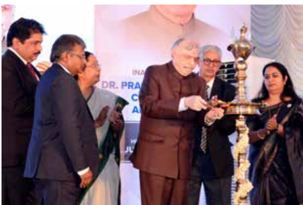
Inaugural lecture by Hon'ble Governor of Kerala Shri Justice (Retd) P Sathasivam