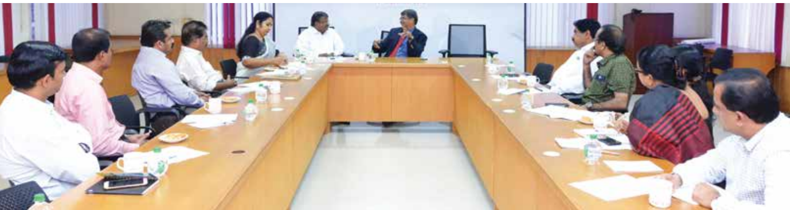
Collaboration with Lincoln University College, Malaysia