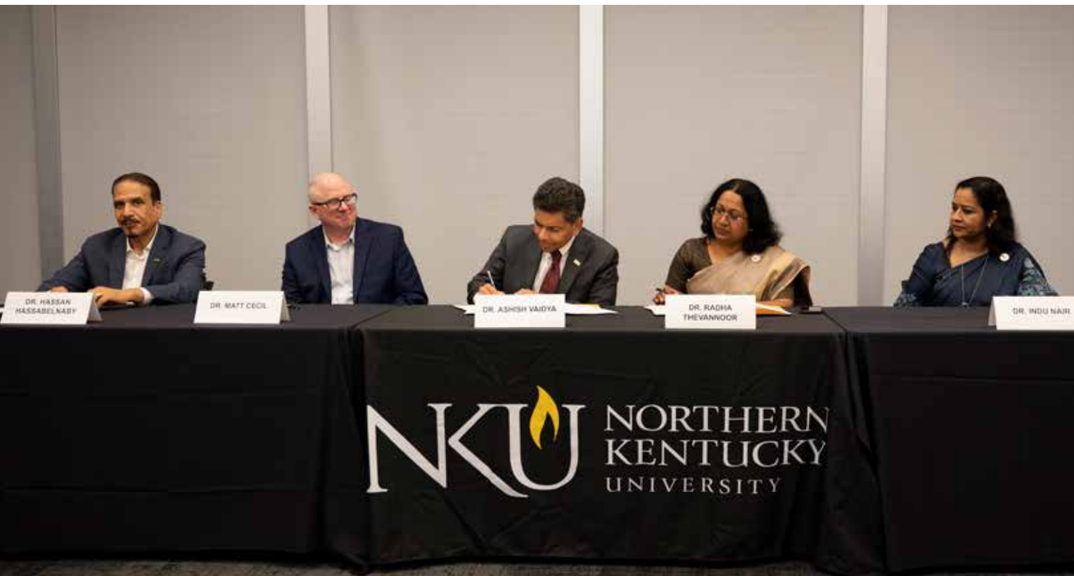
MoU Signing with Northern Kentucky University, USA