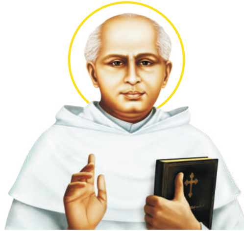
St. Kuriakose Elias Chavara Founder, CMI Congregation

Kristu Jayanti College has been reaccredited by NAAC with 'A' Grade in 2015 and is an Autonomous College under Bangalore University. Housed in a spacious campus, the college incorporates a traditional academic setting with a cutting edge technology. With refreshing environment, beautiful scenery and moderate climate, it provides an atmosphere which is conducive for effective training and learning programmes.