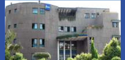
Jagan Institute of Management Studies Sector-5, Rohini, New Delhi