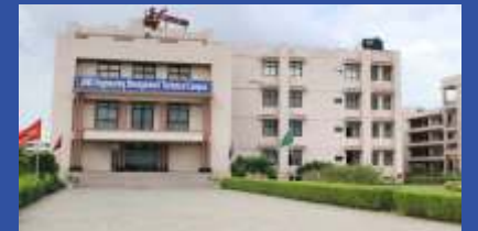
JIMS Engg. Management Technical Campus Knowledge Park-III, Greater Noida, U.P.