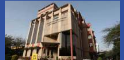
Jagannath International Management School Kalkaji, New Delhi