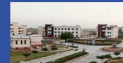
Jagan Institute of Management Sciences Sector-3, Rohini, Delhi