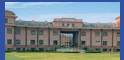
Jagannath Gupta Institute of Engg. & Technology Jaipur (Rajasthan)