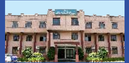
Jagan Institute of Management Studies Jaipur (Rajasthan)