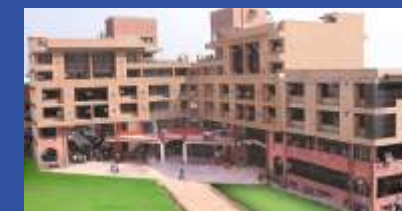
Jagannath University Village Rampura, Tehsil Chaksu, Jaipur (Raj.)