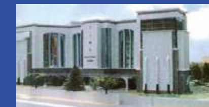
Jagannath International Management School Vasant Kunj, New Delhi