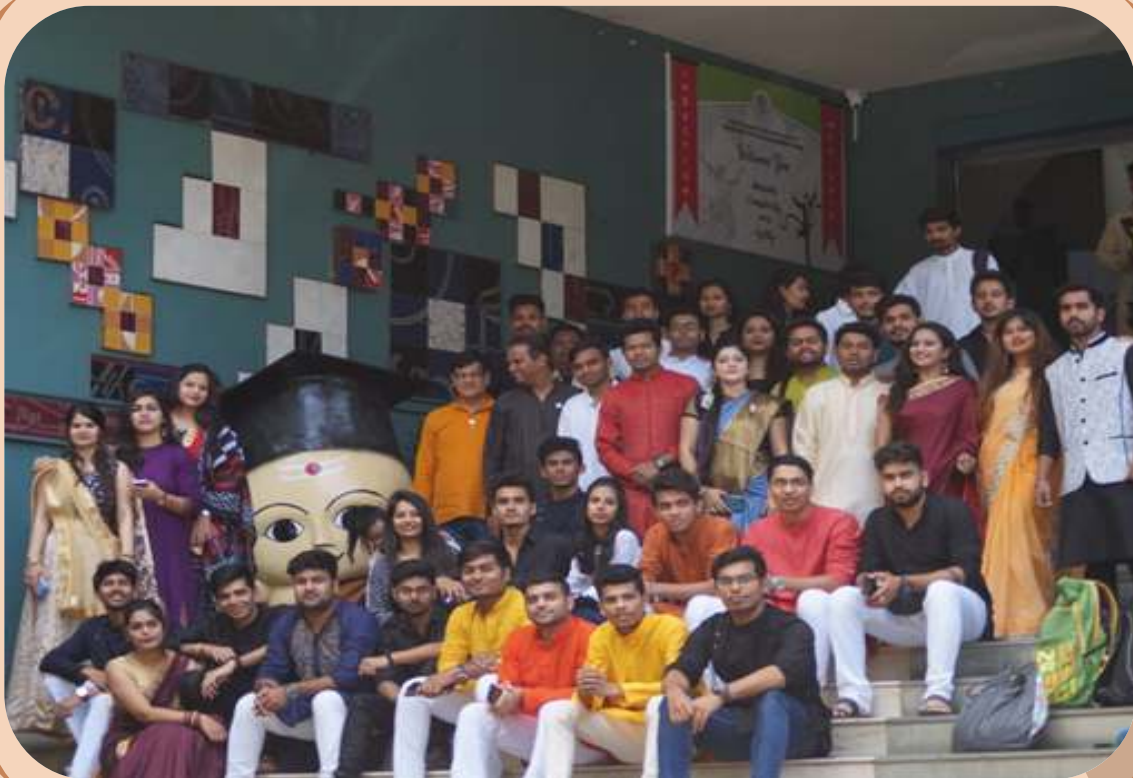
United colours of Indira- Students flaunting the traditional attire of our great country.