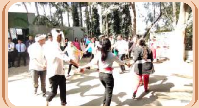
Marketing Club Activity