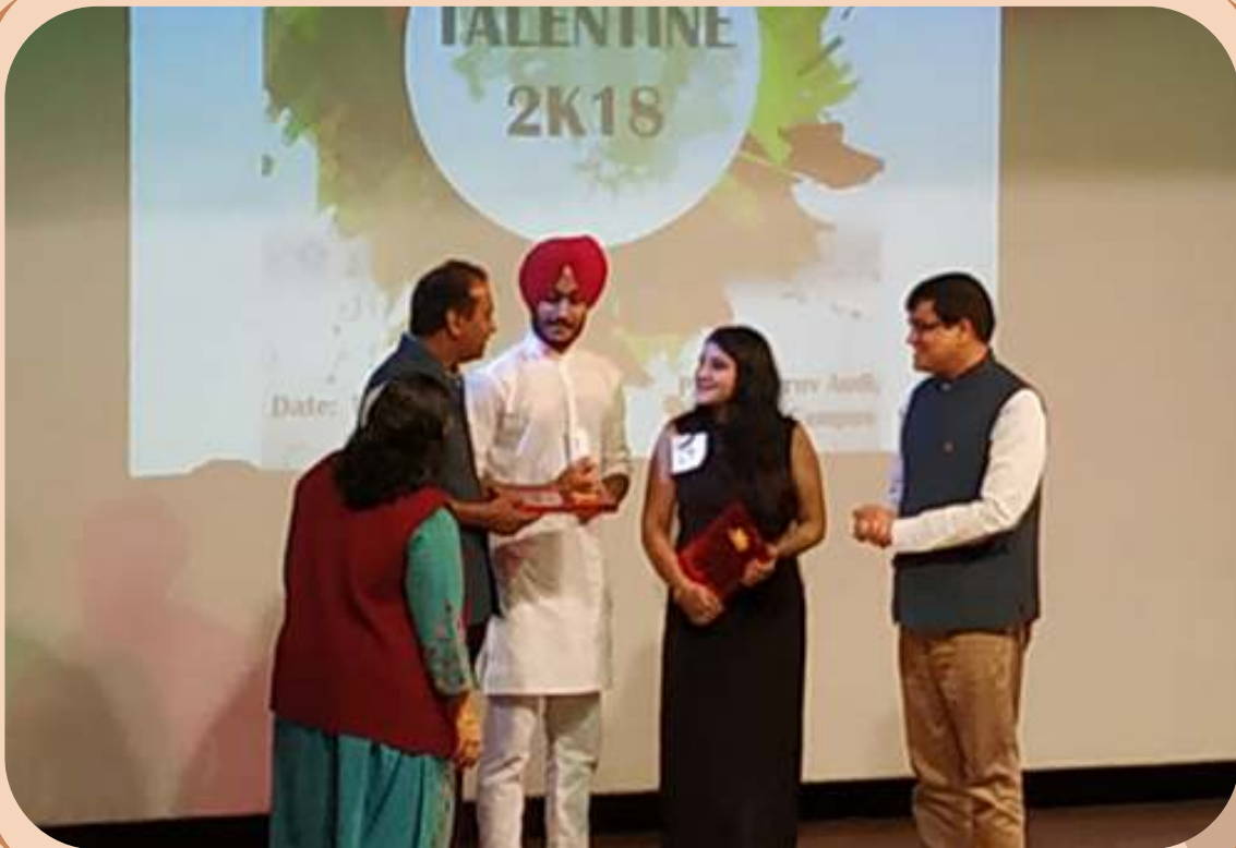
Students showcasing their talents at campus.