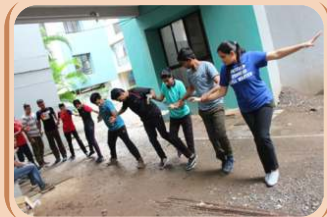
PGDM students immersed in OMT (Outdoor Management Training Programs)