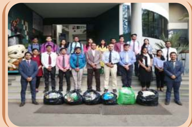
Students and faculty on mission plastic free IGI Neighbourhood

On July 8, 2019, Indira Institute of Management students participated in a paper bag activity. IIM PGDM students made paper bags and wrote messages on them to make an appeal to people not to use plastic as an alternative to plastic and to raise awareness about plastic use. IIM PGDM students participated in a Pedestrian Day activity on October 2nd, 2019. Students asked people to wear their helmets and seat belts, and those who followed the traffic rules were given a Thank You card with the words "You are a Hero" written on it. Furthermore, volunteers requested that riders and drivers give way to pedestrians. The collection of plastic drive activity took place on November 10th, 2019. Indira Institute of Management students organised a plastic collection drive in the college's immediate vicinity. They gathered plastic waste both inside and outside the college. The segregated plastic waste was collected and delivered to the processing unit. On November 11th, 2019, a tree-planting activity was held. Indira Institute of Management Pune, realising the importance of tree planting, organised a successful tree planting by planting 200+ Indian Native Plants across three Indira Group of Institutes campuses.