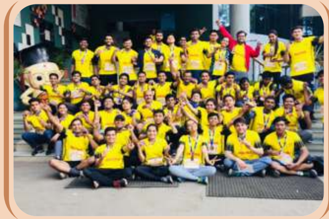
Jubilant students of 18–20 batch after participating in a mini marathon event in Pune City

Indira strongly believes that an individual's efficiency and effectiveness are directly related to his or her mental and physical health. We have implemented a fitness programme that includes GYM, YOGA, and AEROBICS in order to instil these qualities in our students. Students who join INDIRA are required to attend fitness classes three times per week. Furthermore, every year, Sport's Day is held, during which students compete in various track and field events as well as team games.