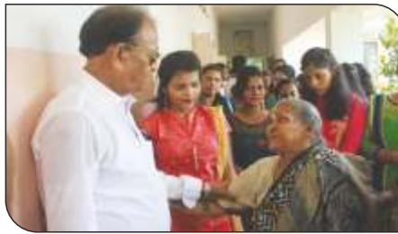
OLD AGE HOME