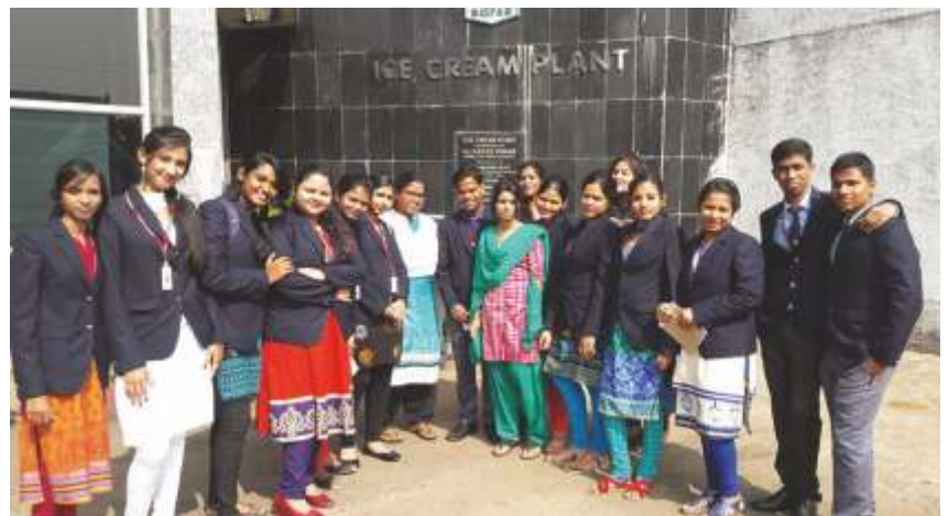
Visit to Celesty Ice cream plant at Bhubaneswar

Student's visit to one of the largest Aluminum plant of the world and a Nava Ratna (PSU) and private sector food processing unit imparted great knowledge to students and gave a feel of the Industry working scenario and they learnt managing process, supply chain management, sales and marketing, finance and accounting, and CSR activities.