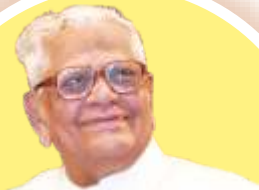
Shri R. Venkatraman Visited on 04. 01. 2003 Inauguration of Centre for Communication & Management