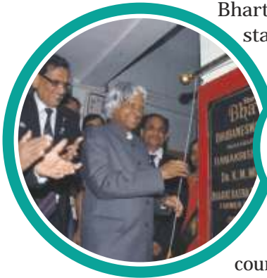
Former President of India Dr. APJ Abdul Kalam visited on 15th January 2011 & Inaugurated Dr. K.M. Munshi Hall

Bhartiya Vidya Bhavan was founded in 1938 at Mumbai by the great visionary, statesman, philosopher and philanthropist, Dr. K. M. Munshi with the blessings of the Father of the Nation, Mahatma Gandhi . At present, Bhavan has 119 centers with 367 institutions in India and 9 centers abroad, in London, New York, Sydney, Brisbane, Mexico, Toronto, Durban, Singapore and Dubai. Bhavan runs a number of leading Business Schools such as, S. P.Jain Institute of Management and Research, Mumbai, M. P. Birla Institute of Management, Bengaluru, Bhavan's Institute of Management Science at Kolkata, Delhi, Mysore, Kochi, Bhubaneswar and in various other places across the country. Government of India recognized it as an Educational Institution Of National Eminence and conferred "GANDHI PEACE AWARD" in the year 2002.