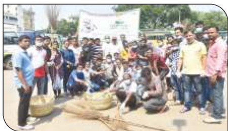
“Clean India-Green India” by students of BCCM inspired by “Swachata-Hi-Seva” initiative made by the Prime Minister of India Shri Narendra Modi.