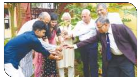
ONE STUDENT... ONE TREE