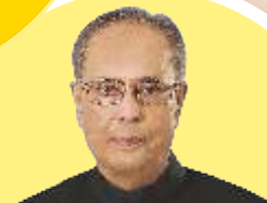
Shri Pranab Mukharjee Visited on 07. 09. 2013 Dedication of Public Library to the people of Odisha, Graced Convocation 2013