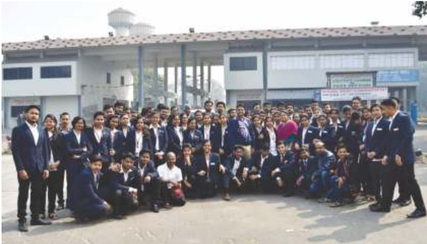
Visit to Nalco - Angul plant (Asia's largest aluminum complex)

As part of the curriculum, students visit to different industries every year. This industrial visits help them to gain practical experience and exposure. They get opportunity to meet and interact with experienced industry professionals, on job work force and gain insights about the various aspects of business operations.