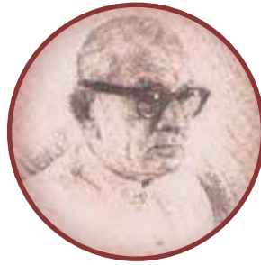
Kulapati Dr. K.M. Munshi