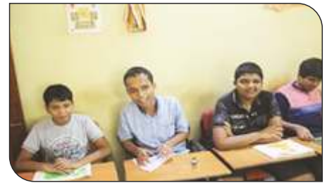
VISIT TO ASHRAYA CENTRE OF AUTISM AT CUTTACK