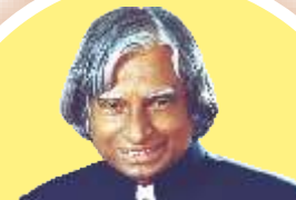
Dr. A.P.J. Abdul Kalam Visited on 15. 01. 2011 Inauguration of Dr. K M Munshi Hall