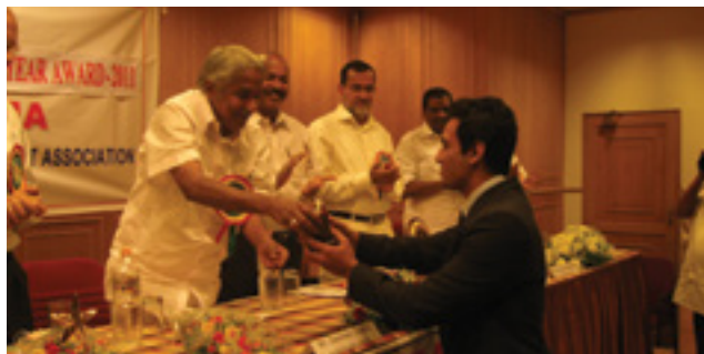
Southern Regional Winners of National Essay and Presentation Competition conducted by All India Management Association