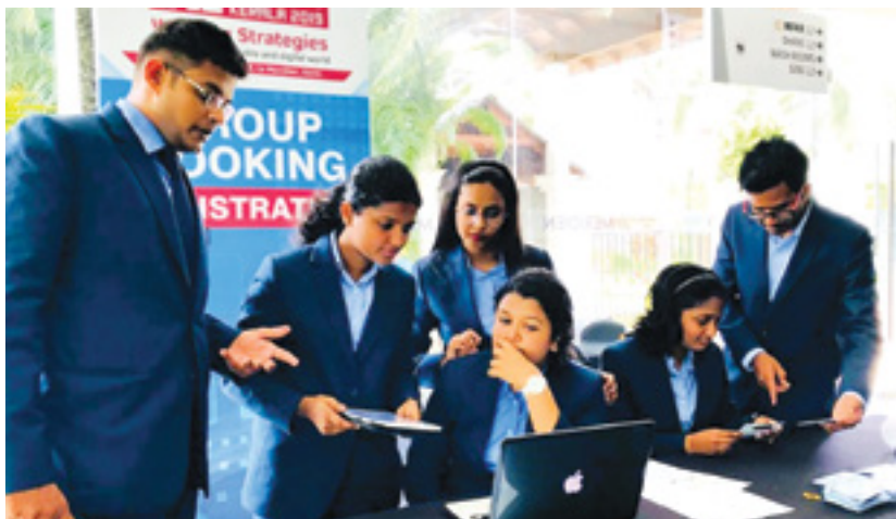
Students at TiECON 2019