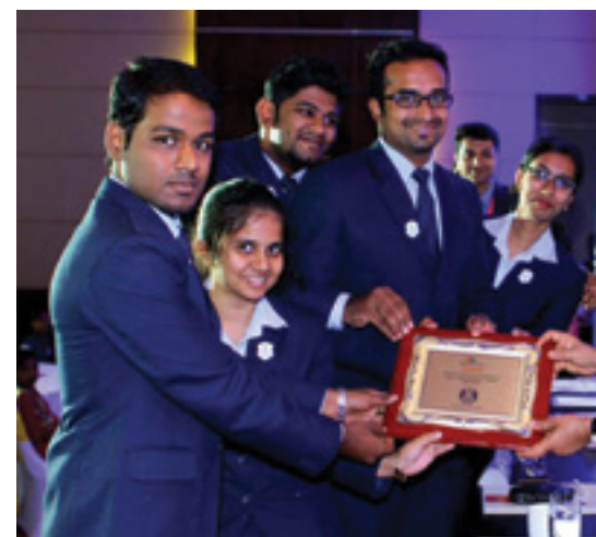
Saintgits team with the winners trophy of The I Cochin Chamber of Commerce and Industry