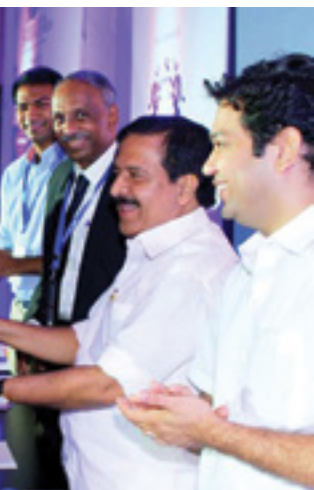
Business Plan Contest by the