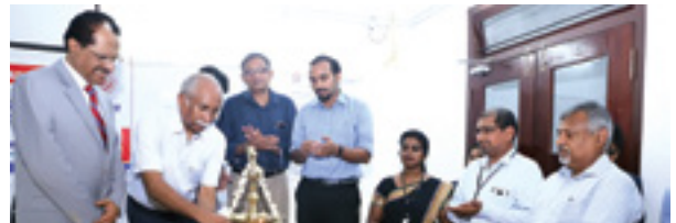
NIPM - Saintgits Chapter Inauguration

The management fest of the students of Saintgits Institute of Management is the forum for management students from different parts of the state of Kerala and outside to come together, share, compete and learn. These meets are the places where networking happens and students get exposed to another environment. Simthesis 2019 provided opportunity for more than 600 students to meet and interact. The events, mostly based on functional areas of management were designed specially to test knowledge and aptitude in the respective area. The institution and students see these events as an opportunity to learn, practice what is learnt in the class room and broaden their thinking. The theme of Simthesis has been: Imagine, Innovate and Implement.