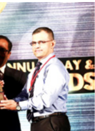
...tights is selected as the best Management Association.