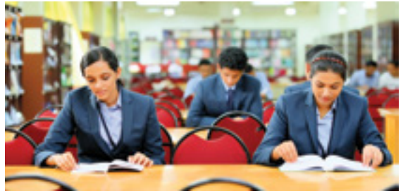
Well stocked library